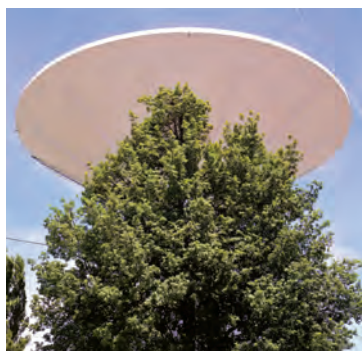
Parc de Séguinaud, Bassens July 2010