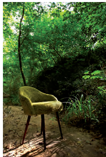
Domaine de la Burthe, Floirac July 2010