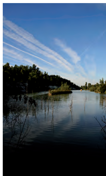
Parc de l'Ermitage, Lormont July 2010