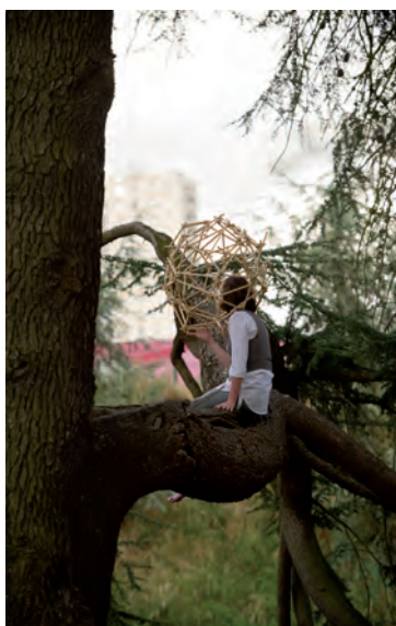
Parc Palmer, Cenon July 2010