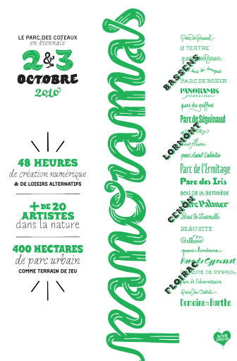
panoramas 2010 - cover page